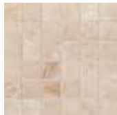
1093348 2"x2" Mosaic (12"x12")