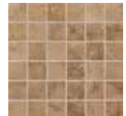
1093170 2"x2" Mosaic (12"x12")