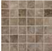
1093278 2"x2" Mosaic (12"x12")