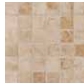
1093169 2"x2" Mosaic (12"x12")